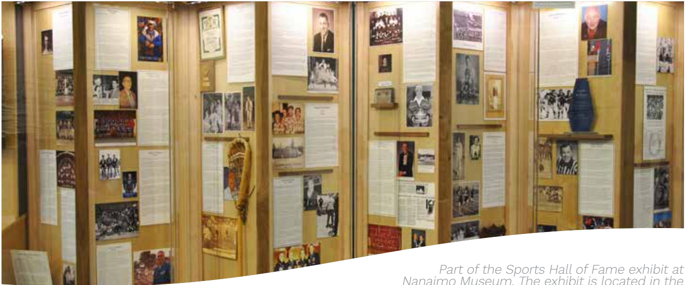
Part of the Sports Hall of Fame exhibit at Nanaimo Museum. The exhibit is located in the museum lobby and is free for everyone to visit.