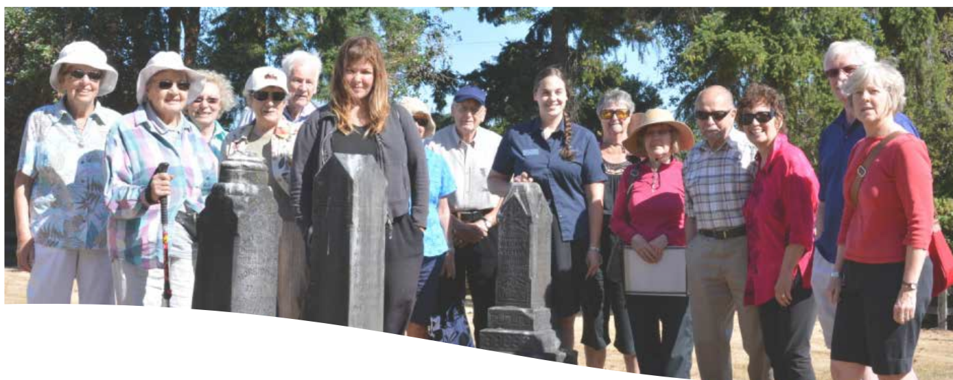
2015 Wellington Cemetery Tour Group